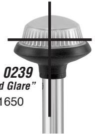
Globe 0239 "Reduced Glare" Fig. 1650

This is a 3/4" circle in order to scale internet printed templates