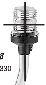
Globe 0248 Fig. 1311 & 1330