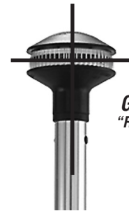
Globe 0238 "Reduced Glare" Fig. 1431 & 1632